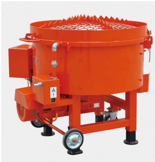
LRM100 & LRM250 Model

LRM refractory pan mixer is specially designed for mixing refractory, castables materials etc. Which is available in a stationary or practical mobile design, is characterised by top performs. In order to ensure easy to move in the working site, LRM100 and LRM250 refractory pan mixer is equipped with walking wheel, LRM500 have forklift hole in the frame. There is high wear-resistant steel liner in the mixer bottom and inner wall, five pieces different purpose mixing arms could ensure refractory materials mix evenly and void sticking.