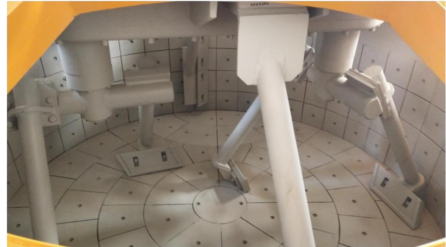
The counter-current mixing device makes the complex mixing locus and high efficient result. The reasonable load distribution of gearing system gives fast and thorough discharging