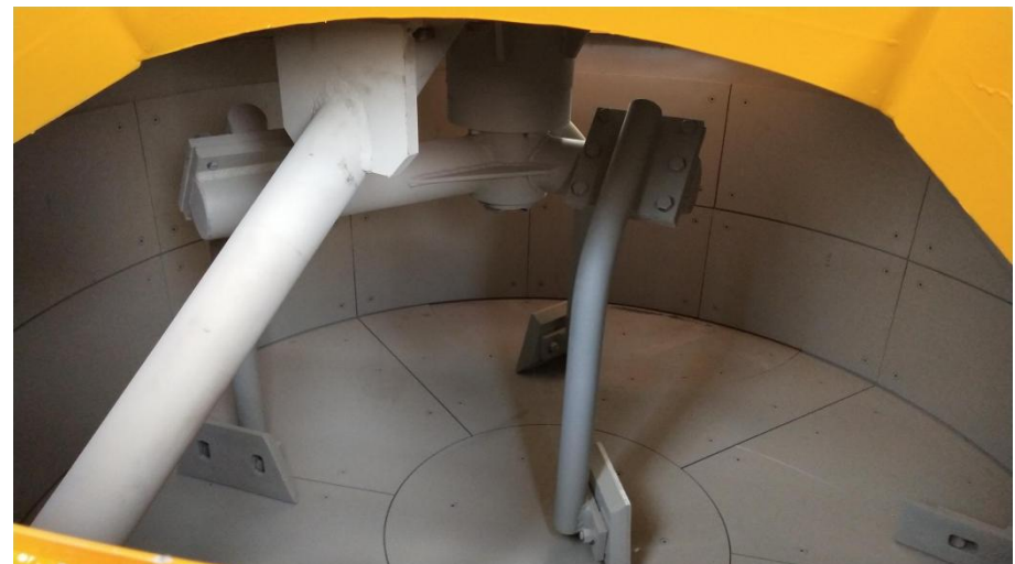
Cr-hard alloy cast iron liner and mixing blade.