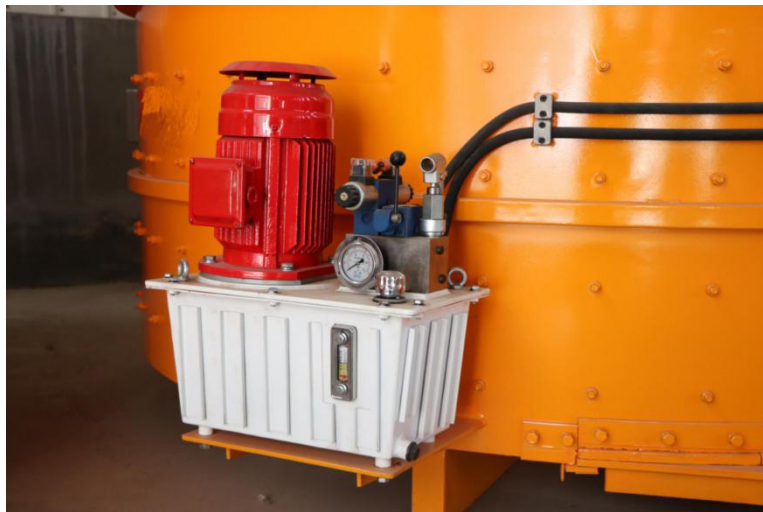
Hydraulic unit equipped with manual pump allows the door be opened in case of electric failure.