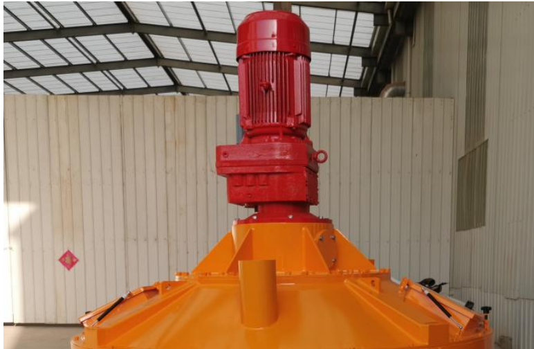
The counter-current gearing system has higher transmission efficiency, excellent mixing result and longer service life