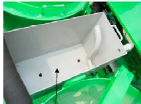
60L Water tank