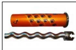
Rotor, stator (pump core)