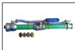
High pressure gun