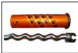
Rotor, stator (pump core)