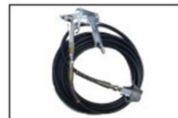
Mixed gas gun