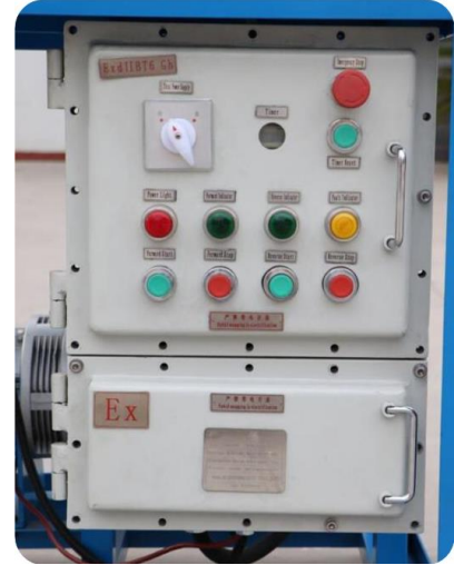
Explosion proof electric control box for option