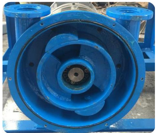
Pressure shoe structure