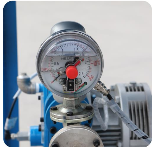
Electric contact pressure gauge