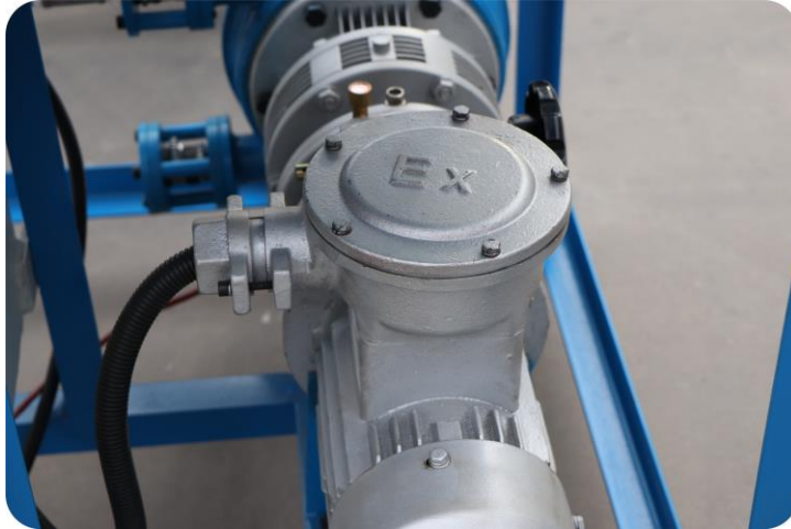
Explosion proof motor for option

电话 TEL.:+86-371-63902781 传真 FAX:+86-371-63526676