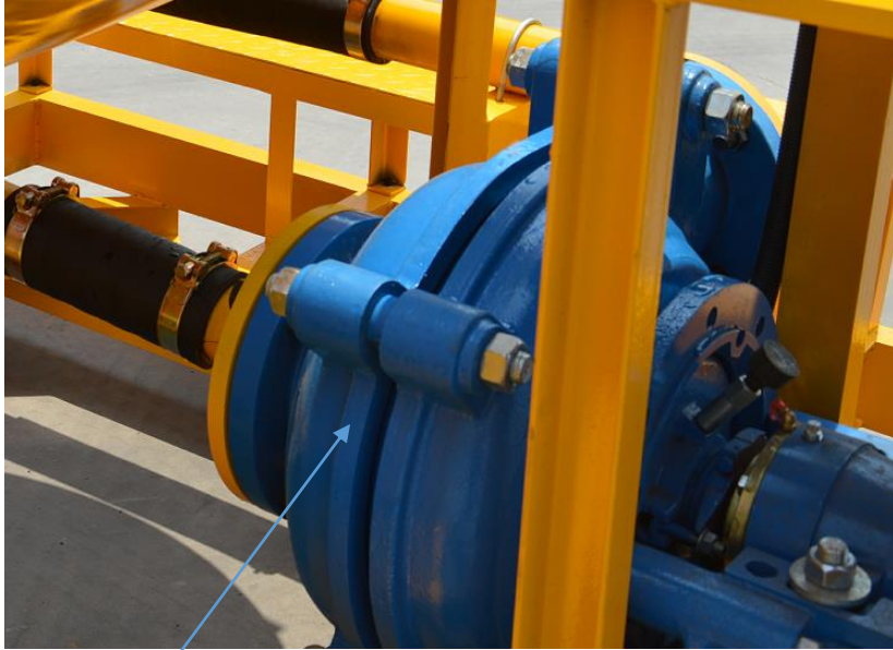
Heavy-duty Slurry pump for recirculating and discharging