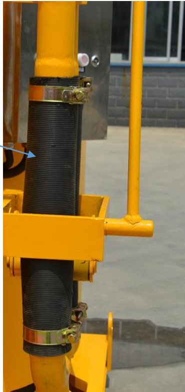
Special Design and Machining Squeeze Hose Valves with million times squeezing work life