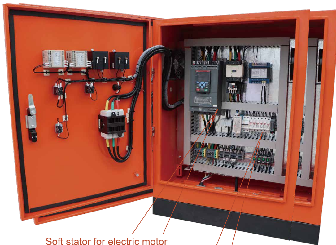
Soft stator for electric motor