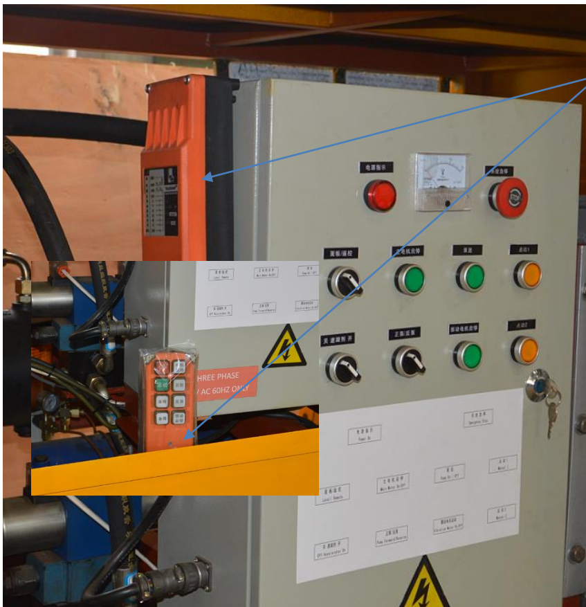
Wireless remote control