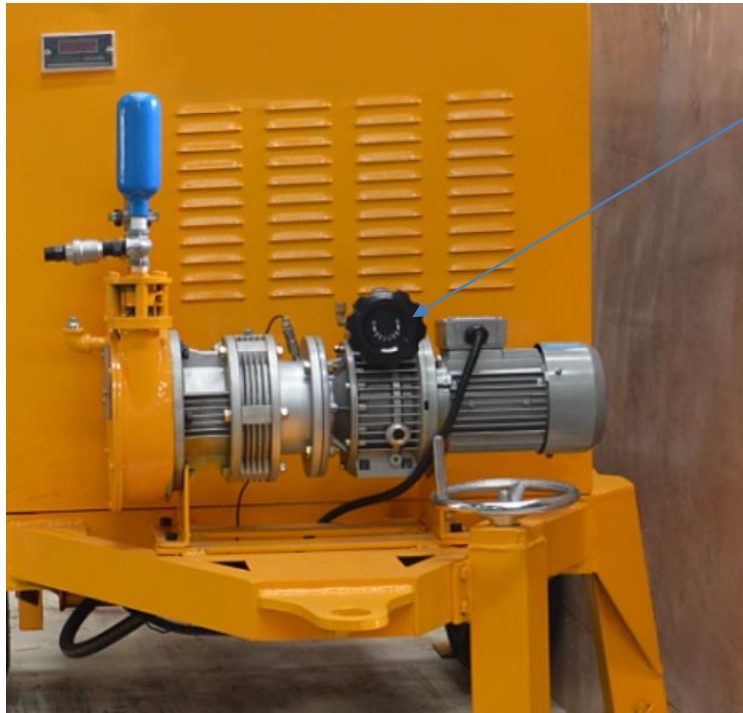
Additive pump stepless speed handle

地址 ADD: 郑州市中原区西流湖街道办事处铁炉村西四环东 邮编 P.C.:450042 .Xisihuan Ring-Road East, Tielu, Xiliu lake sub-district, Zhongyuan District, Zhengzhou, 网址 (Web): http://www.leadcrete.com 邮箱 E-Mail: sales@leadcrete.com 电话 TEL.: +86-371-63902781 传真 FAX: +86-371-63526676