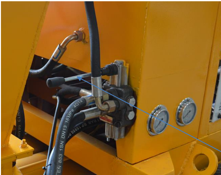
Hydraulic Valve of Agitator Forwarder and

地址 ADD: 郑州市中原区西流湖街道办事处铁炉村西四环东 邮编 P.C.:450042 .Xisihuan Ring-Road East, Tielu, Xiliu lake sub-district, Zhongyuan District, Zhengzhou, 网址 (Web): http://www.leadcrete.com 邮箱 E-Mail: sales@leadcrete.com 电话 TEL.: +86-371-63902781 传真 FAX: +86-371-63526676