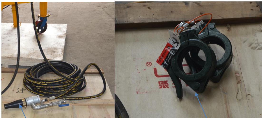
Shotcrete spray nozzle